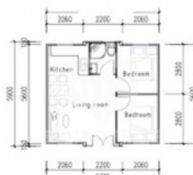
Two bedrooms 两室一厅