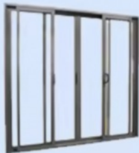
Broken bridge aluminum door