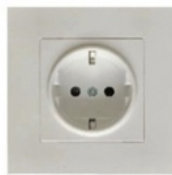
EUR Standard 欧标