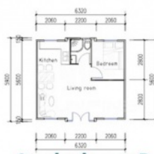
One bedroom B 一室一厅B