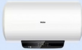
Electric water heater