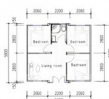
Three bedrooms 三室一厅