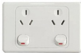
AU Standard AU标准