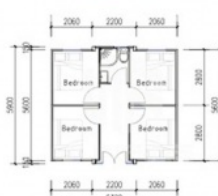
Four bedrooms 四卧