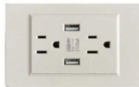
US Standard 美标