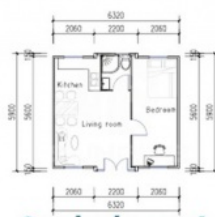
One bedroom A 一室一厅A