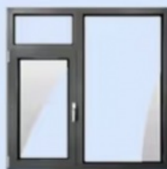
Broken bridge aluminum window