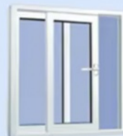
Plastic steel window