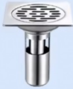
The floor drain